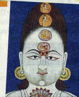
WONDER | Indian 19th century art

Breathtakingly intricate and boldly coloured, these